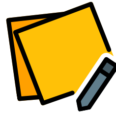
Post-it Notes or Printed Questions